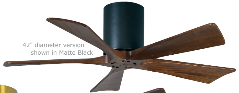
42" diameter version shown in Matte Black