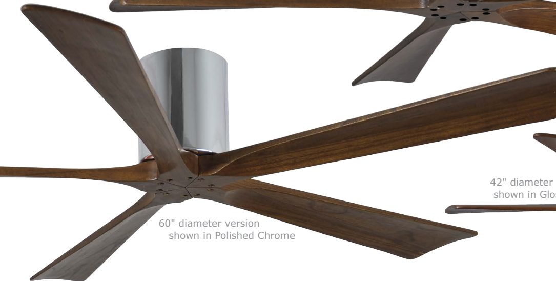
60" diameter version shown in Polished Chrome