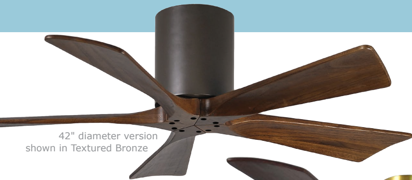
42" diameter version shown in Textured Bronze