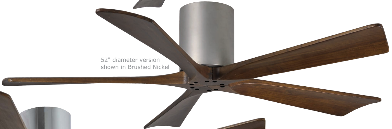
52" diameter version shown in Brushed Nickel