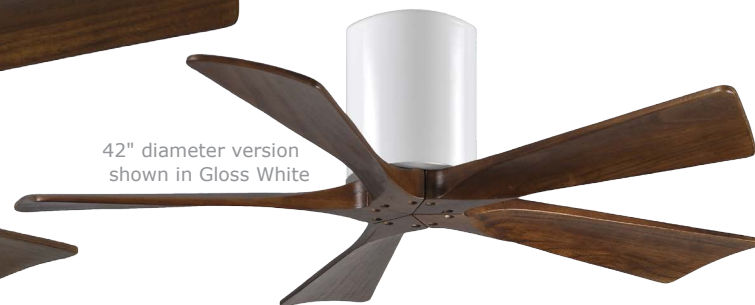
42" diameter version shown in Gloss White

Cutting a figure like no other, Irene-5H ceiling-mount fan, is rustic, yet strikingly modern with five neatly joined, solid walnut-toned wooden blades. A cylindrical motor housing complements its minimal profile. Irene-5H is streamline while still appearing warm and natural.